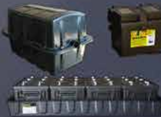
Battery boxes, trays, hold-downs and hooks pg. 103 – 112