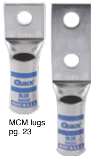
MCM lugs pg. 23