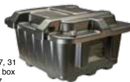
Dual 27, 31 battery box pg. 107