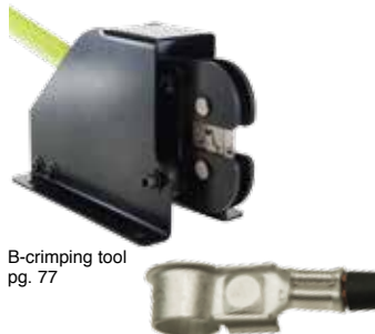
B-crimping tool pg. 77