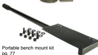
Portable bench mount kit pg. 77