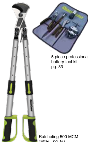
5 piece professional battery tool kit pg. 83