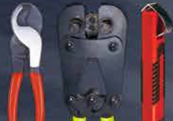
Crimping, cutting, stripping and battery utility tools pg. 76 – 85