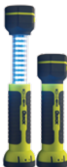
Flashlight/worklight pg. 102