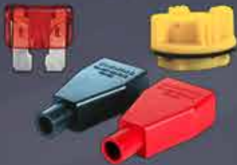
Terminal protectors, battery vent caps and fuses pg. 36, 37, 62-65