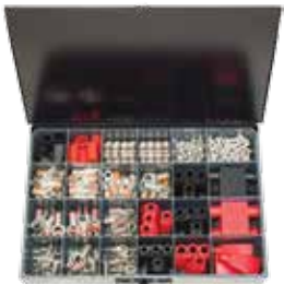
Heavy duty crimp kit pg. 9