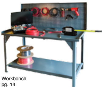
Workbench pg. 14