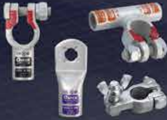
100's of clamps & lugs – heavy duty, automotive, lead-free pg. 16 – 27