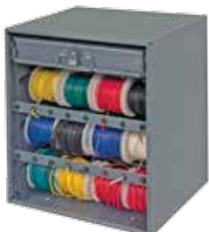
Storage cabinet pg. 15