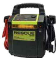
Rescue 3100 pg. 95