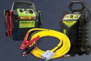
Portable power packs and a full line of booster cables pg. 87 – 102