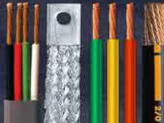
Cable, primary wire, braided ground strap, bonded pg. 40 – 55