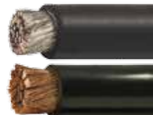
DLO RHH/RHW and MTW cable pg. 45