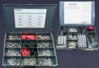
Basic cable making kits for different applications pg. 6 – 8