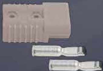
SB® & SBX® connectors, housings and accessories pg. 72 – 75