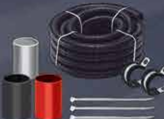
Protective loom, cable ties and clamps, heat shrink tube pg. 58 – 61