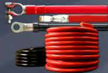
Bulk rolls, pre-made and custom cable pg. 40 – 55