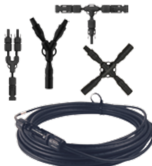
PV connectors and cable pg. 56