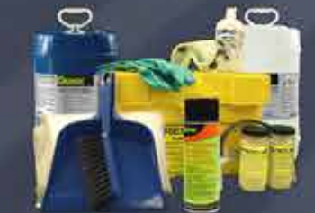
Battery acid spill kits, chemicals and cleaners pg. 116 – 123