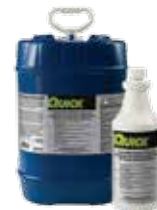
Industrial battery cleaner pg. 123